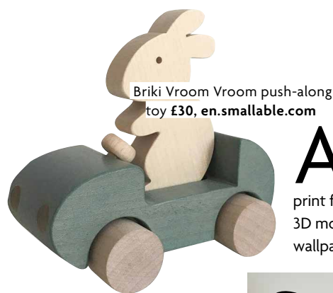
Briki Vroom Vroom push-along toy £30, en.smallable.com

The Scandinavian nursery – featuring a palette of grey, white and black with a pastel pop of blush, mustard or duck-egg blue and natural wood – is a popular choice. Pale grey or white walls can be decorated with dot or raindrop wall stickers, accompanied by charming prints or inspirational words. This modern nursery (below) designed by blogger Stevie Maxine Watson is the perfect example – I love the backdrop of gold dots on an all-white canvas.