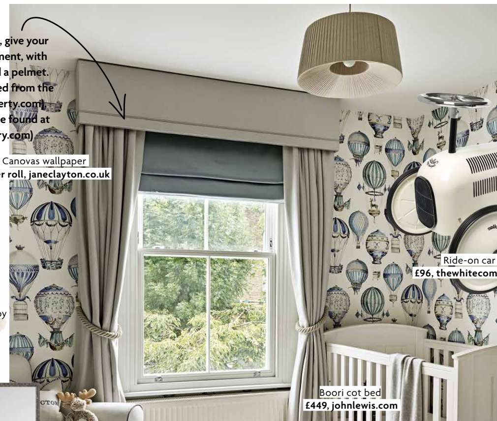
Manuel Canovas wallpaper from £138 per roll, janeclayton.co.uk

To achieve a luxurious look, give your window the layering treatment, with a roman blind, curtains and a pelmet. Fabric like this can be sourced from the Romo range at Liberty ( liberty.com ), while similar tiebacks can be found at Style Library ( stylelibrary.com )