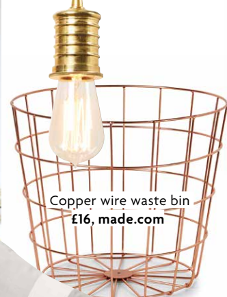
Copper wire waste bin £16, made.com