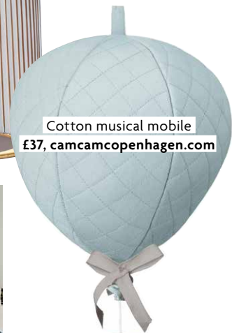
Cotton musical mobile £37, camcamcopenhagen.com

More traditional nursery will always be in fashion. Using a bold hot air balloon print on the walls not only introduces a travel theme but it's also a beautiful print for babies to focus on. You can feature balloons as a 3D mobile, hung from the ceiling or over the cot, or by using wallpaper like Lily Paulson-Ellis has in this room (below).