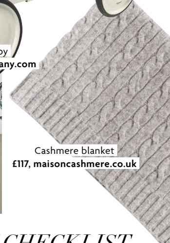
Cashmere blanket £117, maisoncashmere.co.uk