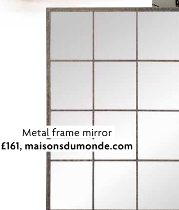
Metal frame mirror £161, maisonsdumonde.com

The Baby Cot Shop in Chelsea has a near-identical chair – the 'Salome' nursery glider, which can be customised from £1,590 ( thebabycotshop.com )