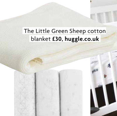
The Little Green Sheep cotton blanket £30, huggle.co.uk

Urban Walls is the go-to for modern wall décor. Although based in Canada, it ships worldwide ( uwdecals.com ). Alternatively, buy a few rolls of gold dotted wallpaper from Eijffinger, from £81 per roll ( wallpaperdirect.com )