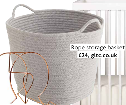
Rope storage basket £24, gltc.co.uk