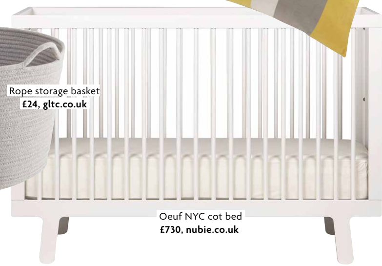
Oeuf NYC cot bed £730, nubie.co.uk