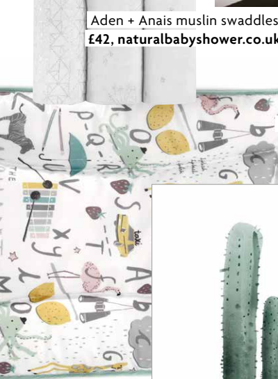
Aden + Anais muslin swaddles £42, naturalbabyshower.co.uk