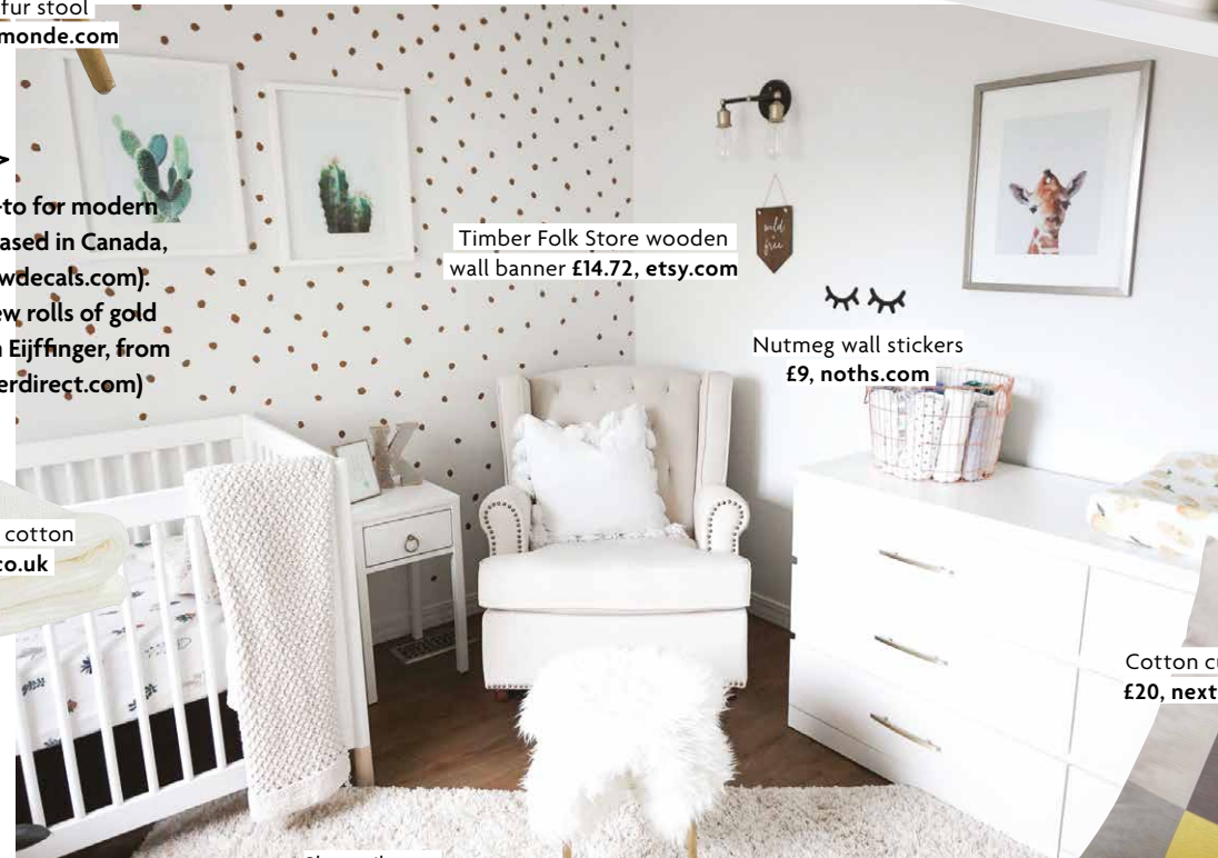
Timber Folk Store wooden wall banner £14.72, etsy.com