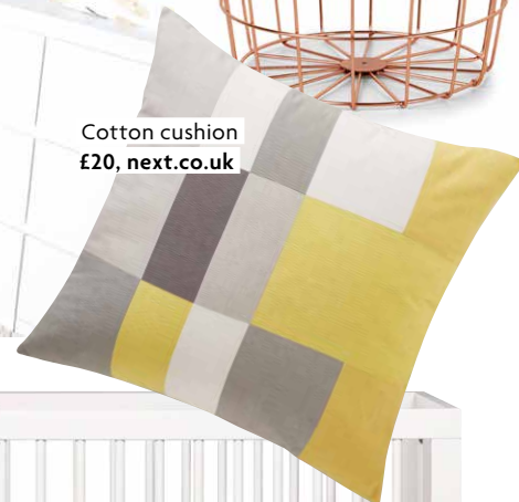
Cotton cushion £20, next.co.uk