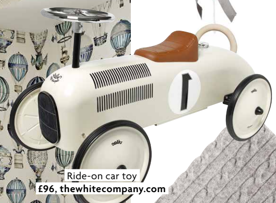
Ride-on car toy £96, thewhitecompany.com