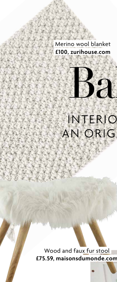
Merino wool blanket £100, zurihouse.com