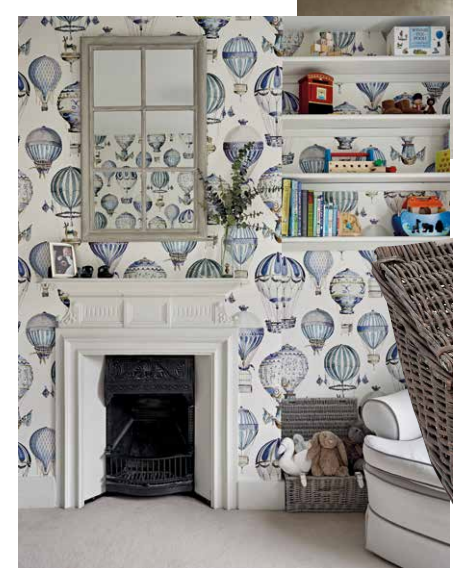
Wicker hamper £20, whittard.co.uk

The Baby Cot Shop in Chelsea has a near-identical chair – the 'Salome' nursery glider, which can be customised from £1,590 ( thebabycotshop.com )