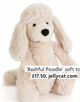
'Bashful Poodle' soft toy £17.50, jellycat.com