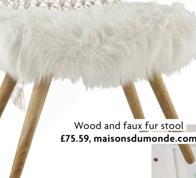
Wood and faux fur stool £75.59, maisonsdumonde.com

Urban Walls is the go-to for modern wall décor. Although based in Canada, it ships worldwide ( uwdecals.com ). Alternatively, buy a few rolls of gold dotted wallpaper from Eijffinger, from £81 per roll ( wallpaperdirect.com )