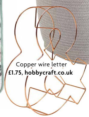
Copper wire letter £1.75, hobbycraft.co.uk