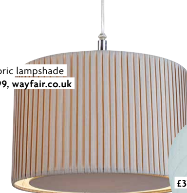
Fabric lampshade £27.99, wayfair.co.uk